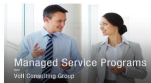
Managed Service Programs Volt Consulting Group