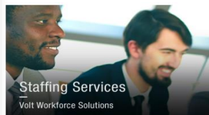
Staffing Services Volt Workforce Solutions