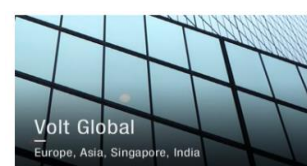
Volt Global Europe, Asia, Singapore, India