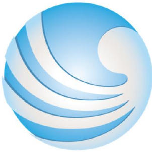
Coda Octopus Group, Inc.