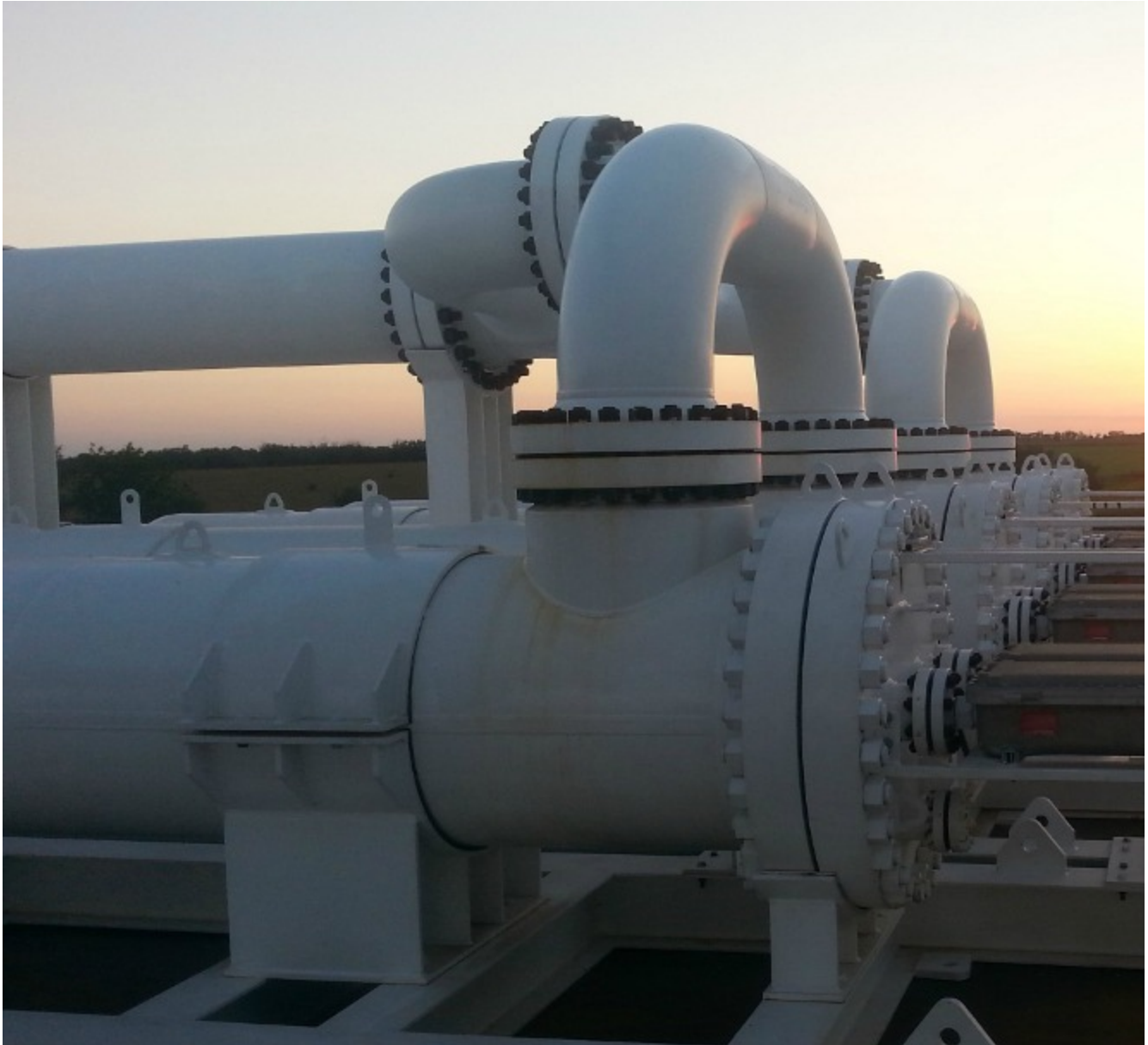
Photo of an AOT Viscosity Reduction System in the field during a beta installation on a pipeline in Udall, Kansas. This primary mid-continent line feeds into Cushing, Oklahoma, often referred to as the “Pipeline Crossroads of the World” and is home to a tank farm with a 90-million-barrel capacity, making it the world’s largest crude oil storage facility.

during the initial term. QS Energy intends to provide each customer with AOT deployment proposals based on their highly specific technical requirements and other issues before we determine final pricing on an installation, including and up to potential return on investment (ROI) for our customer. Therefore, per unit pricing, lease terms and option to purchase price points may vary significantly depending on pipeline characteristics, type of oil being transported, operating pressure, number of units, etc.